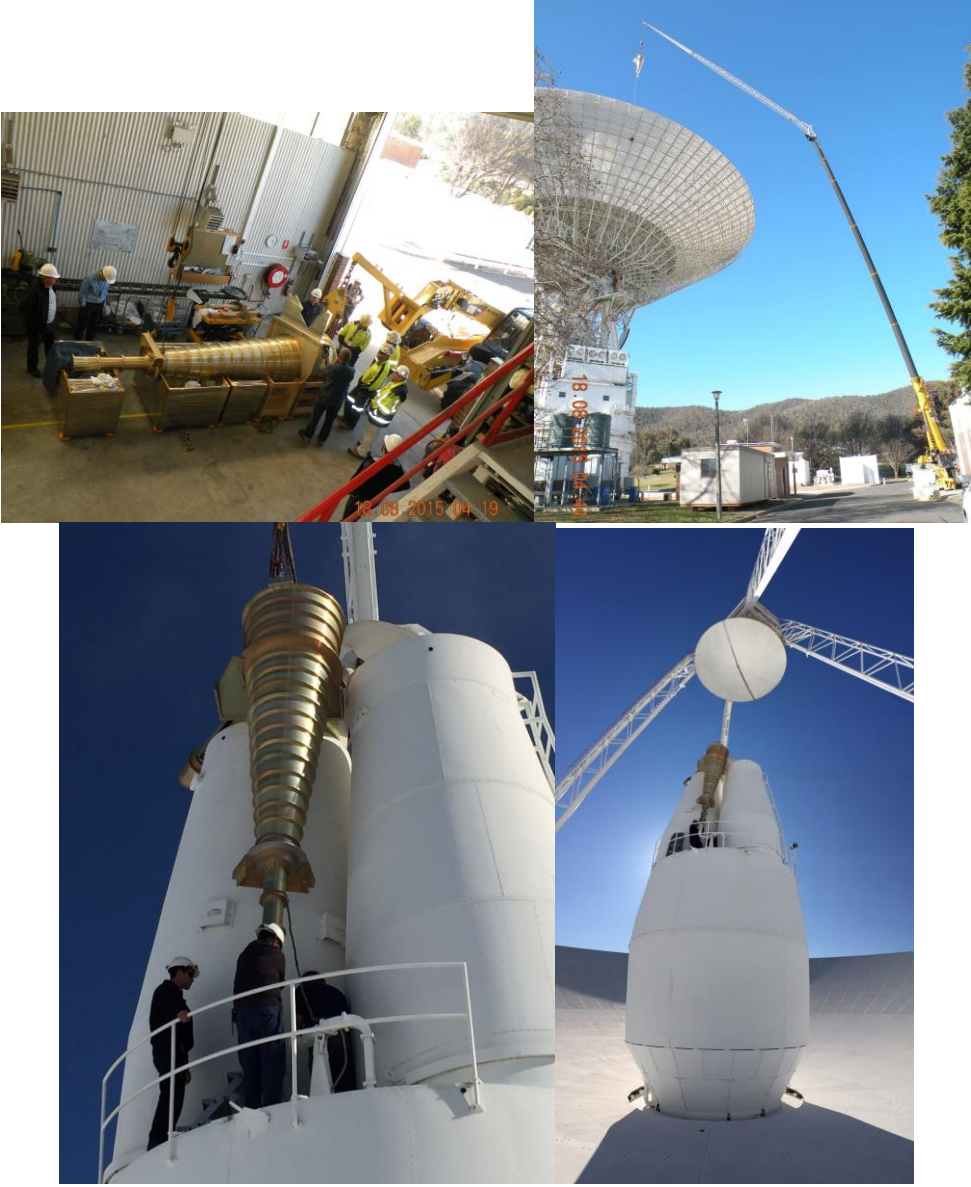
Figure . Details of the installation of the new L-band feed in Canberra, 70m antenna DSS-43.

DSN L-band receiver upgrade to 1.4-1.9 GHz bandwidth: the original L-band feed is band-limited and does not allow the usage of the whole available bandwidth. The replacement corrugated type feed was installed in Canberra DSS-43 70m antenna during last August (Fig. ). It is not decided yet which 70m antenna will get the new L-band feed next.