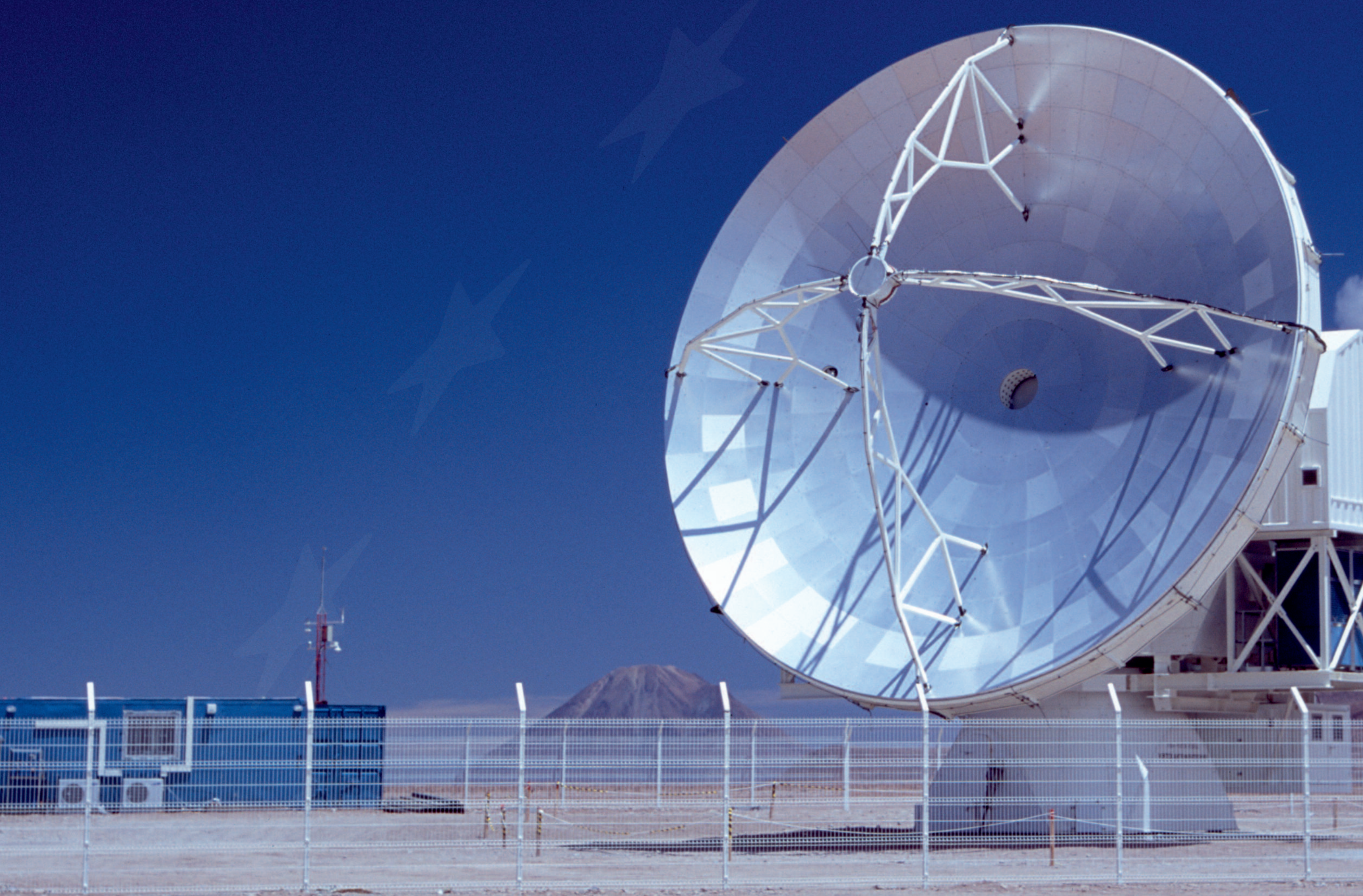
A view of the Atacama Pathfinder Experiment (APEX).